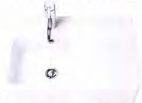
In sink A rectangle within a rectangle. Caroms "Cube" extension basin , $365, Cass Brothers.