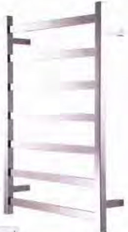
Up they go Modern heating for your bath towels. Mill "Cube" heated towel rail , from $447, Reece.