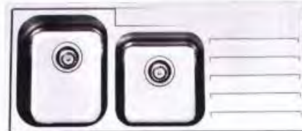
90 degrees Right angles and aligned dish draining, very square indeed. Quatro sink with end bowl, $834, Clark.

I hope you enjoy our special supplement.