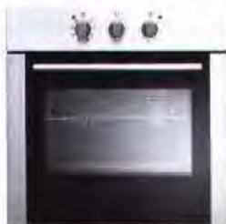
Hot stuff Good-looking, European-made oven with 8 cooking settings, cool-touch door and easy-use controls. Very affordable, too. Everdure OBES82 built-in oven , $519, Bunnings.