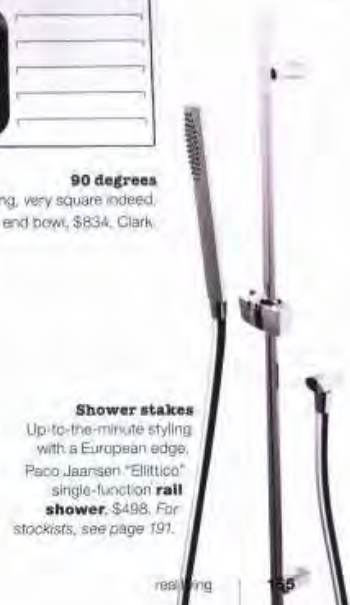
Shower stakes Up-to-the-minute styling with a European edge. Paco Jaansen "Eliittico" single-function shower , $498. For stockists, see page 191.