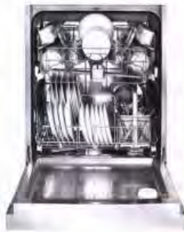
Integrated washing The newest addition to the range. Iive IVSIX3 dishwasher , $2499.