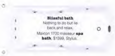
Blissful bath Nothing to do but lie back and relax. Maxton 1700 masseur spa bath , $1599, Stylus.