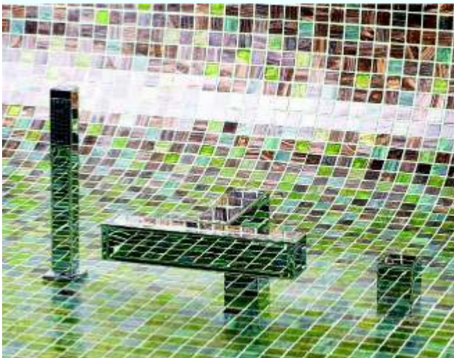
Antonio Miro spa set, $1899.