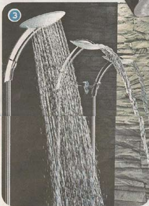
3 The new Hansa2Day shower is a beautiful water display. By tilting the shower head you can transform a needle spray into a natural cascade. Designed and crafted in Germany this design, with a unique point of difference, offers a five-year warranty. Hansa2Day , $938, from Cass Brothers, cassbrothers.com.au