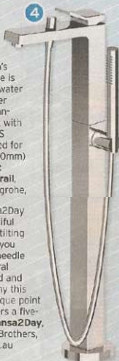
4 The Zucchetti Soft series is made from chrome and the sleek contours are a perfect match for a contemporary bathroom. Zucchetti soft floor-mounted bath mixer with hand-held shower head , $5105, from Cass Brothers, cassbrothers.com.au