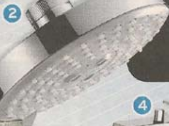
2 The unique Raindance design's point of difference is that it combines water and air for a softer spray. The German-designed product with a three-star WELS rating is best loved for its extra-large (130mm) shower head. Jet shower head on rail , $605, from Hansgrohe,