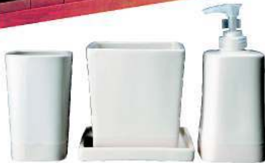
Ikea Vitskar 3-piece bathroom set $10.95