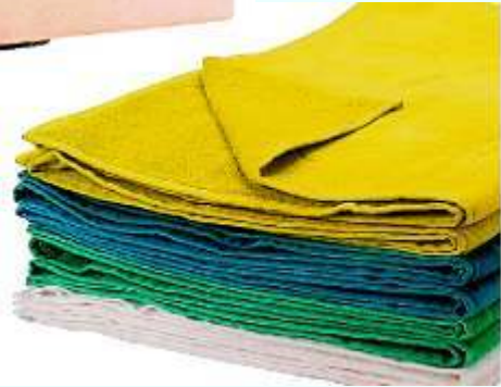
Ikea Aman bath sheet $19.95