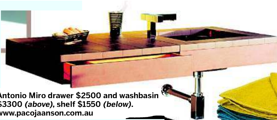
Antonio Miro drawer $2500 and washbasin $3300 (above), shelf $1550 (below). www.pacojaanson.com.au

And for the ultimate in luxury, splash out on a Versace soap holder. The Versace bathroom range is in 24-carat-gold plating and chrome and is inspired by classic 17th century Italian architecture and the neoclassic style of 18th century Italy.