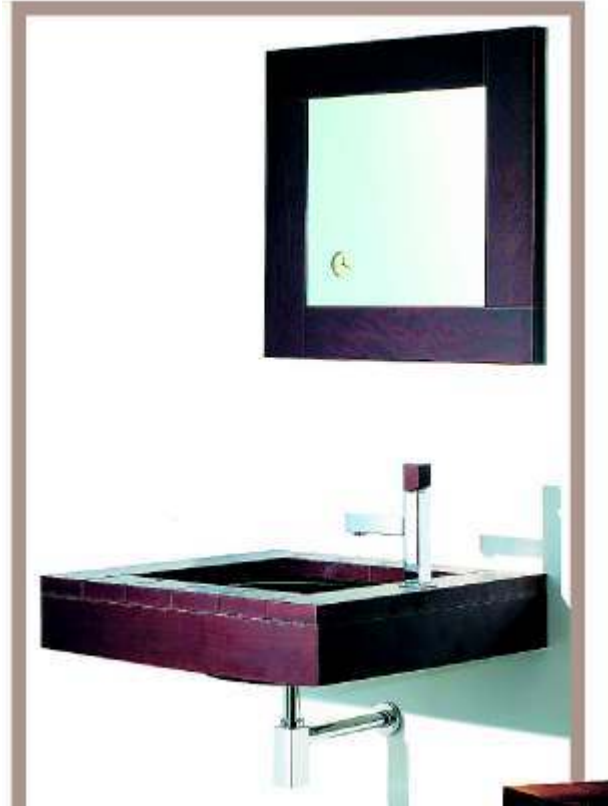
Antonio Miro washbasin $3300, mirror with clock $1050