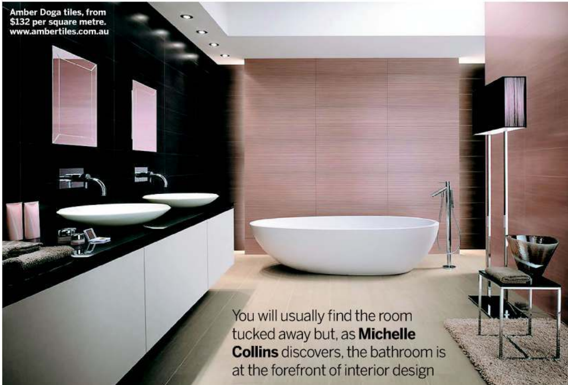
Amber Doga tiles, from $132 per square metre. www.ambertiles.com.au

You will usually find the room tucked away but, as Michelle Collins discovers, the bathroom is at the forefront of interior design