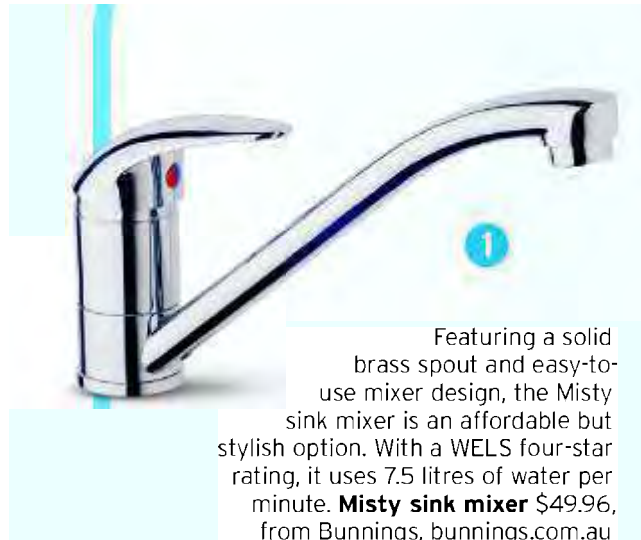
Featuring a solid brass spout and easy-to-use mixer design, the Misty sink mixer is an affordable but stylish option. With a WELS four-star rating, it uses 7.5 litres of water per minute. Misty sink mixer $49.96, from Bunnings, bunnings.com.au