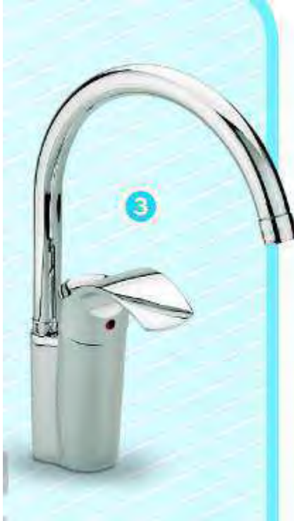
This sophisticated modern European design is sure to turn heads in the kitchen. The Kohler Wave is of solid brass construction, has a four-star WELS rating and uses 7.3 litres of water per minute. Kohler Wave Kitchen Mixer $529, kohler.com.au , or tradelink.com.au