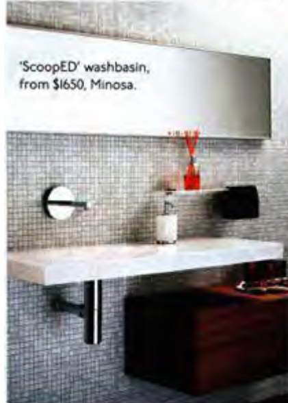
'ScoopED' washbasin, from $1650, Minosa.