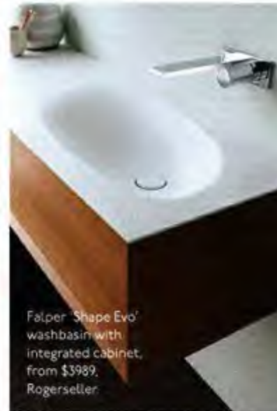
Falper 'Shape Evo' washbasin with integrated cabinet, from $3989, Rogerseller.