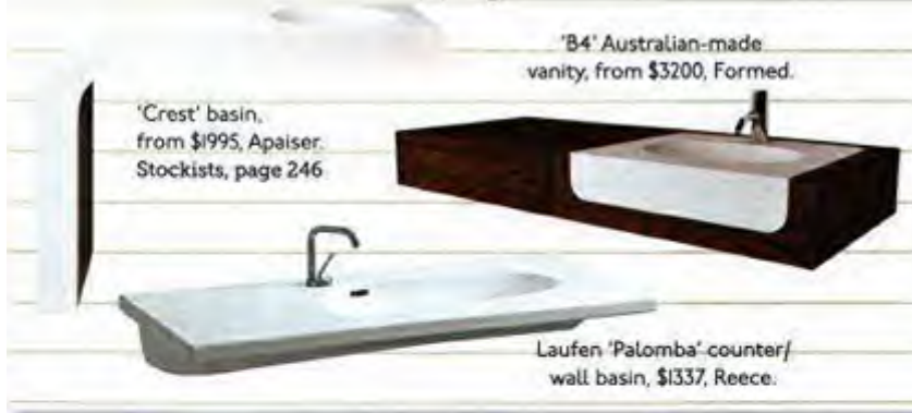
'Crest' basin, from $1995, Apaiser. Stockists, page 246