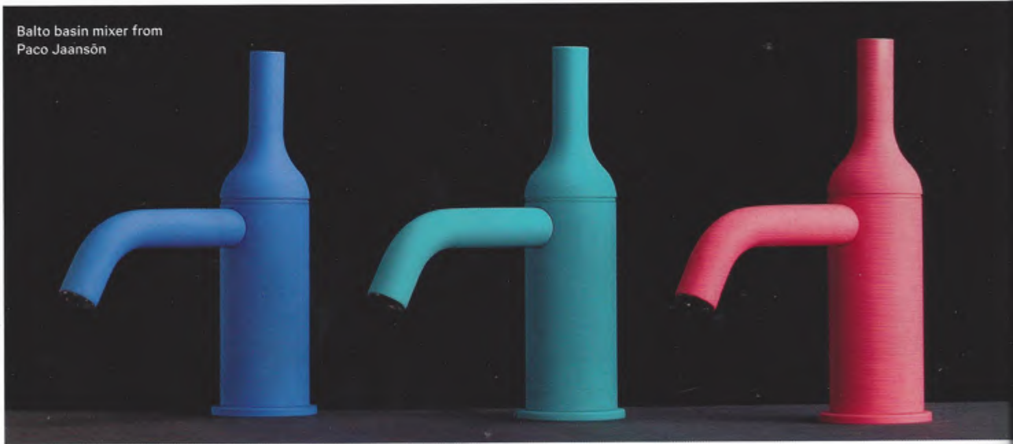
Balto basin mixer from Paco Jaanson