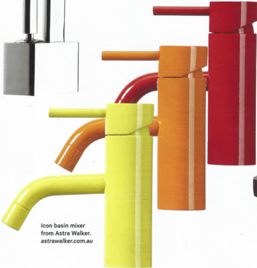
Icon basin mixer from Astra Walker. astrawalker.com.au