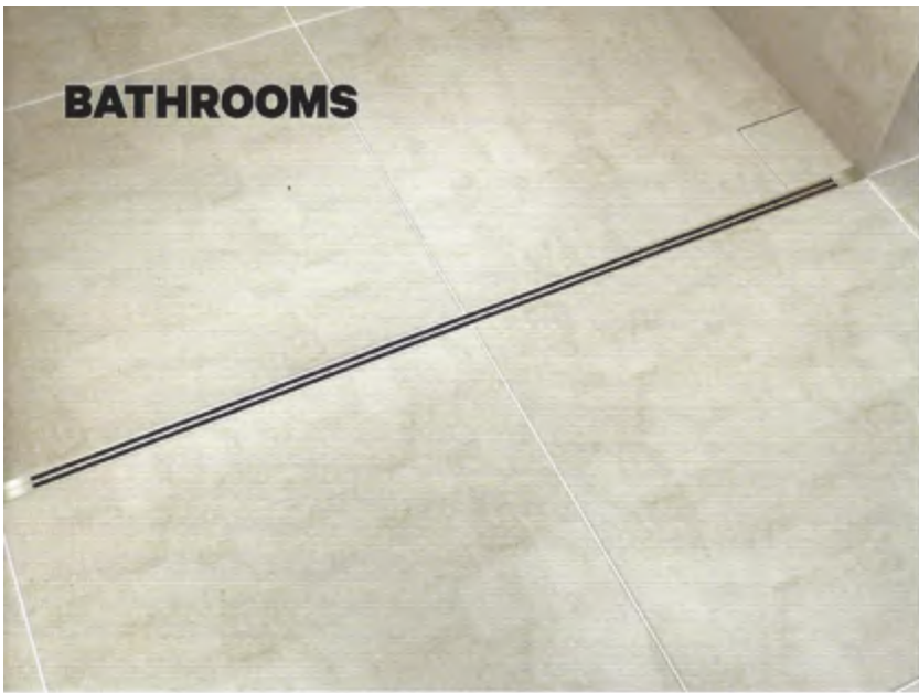
LEFT Blade shower drain from Aquabocci. aquabocci.com