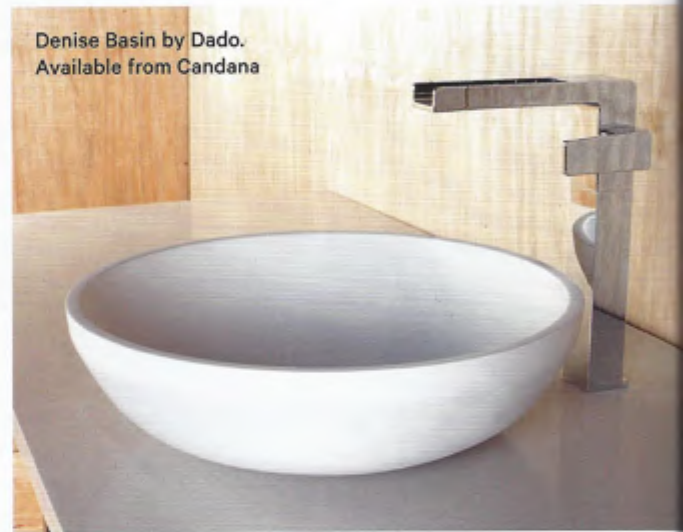
Denise Basin by Dado. Available from Candana