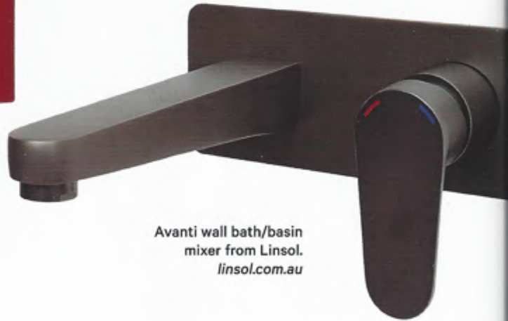
Avanti wall bath/basin mixer from Linsol. linsol.com.au