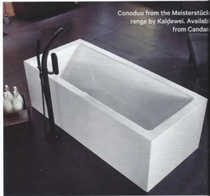
Conoduo from the Meisterstück range by Kaldewei. Available from Candana