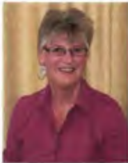
CONSULTANT IN HYGIENE MANAGEMENT & CLEANING