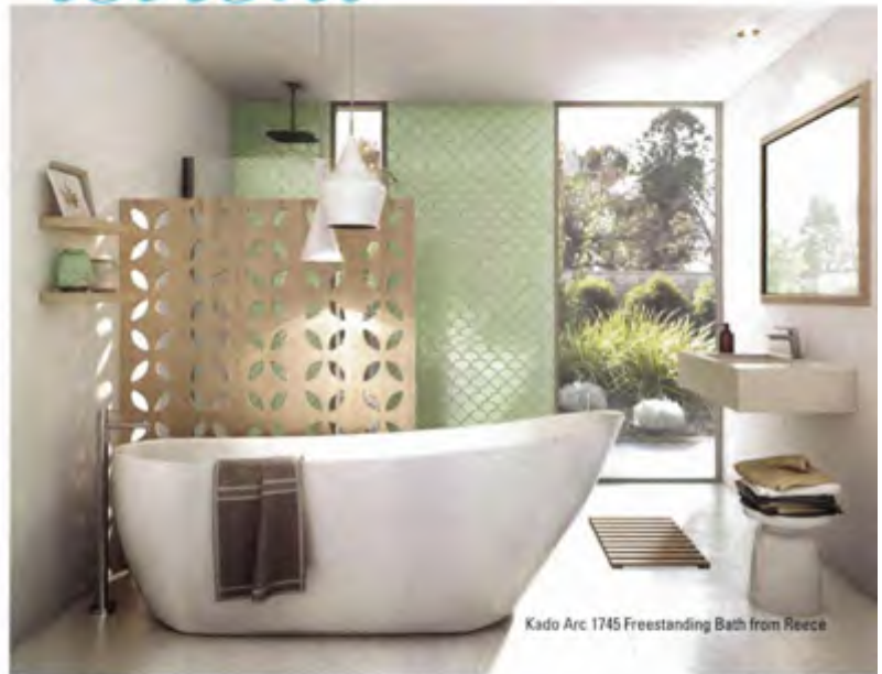
Kado Arc 1745 Freestanding Bath from Reece

Below: Teknobil Loop Cascade Basin Mixer, Posh Solus 900 All-Drawer Wall-Hung Vanity Unit, Roca The Gap Rimless Back-to-wall Close-coupled Toilet Suite, Posh Solus 1780 Freestanding Bath, Teknobil Loop 200 Wall Bath Mixer Set.