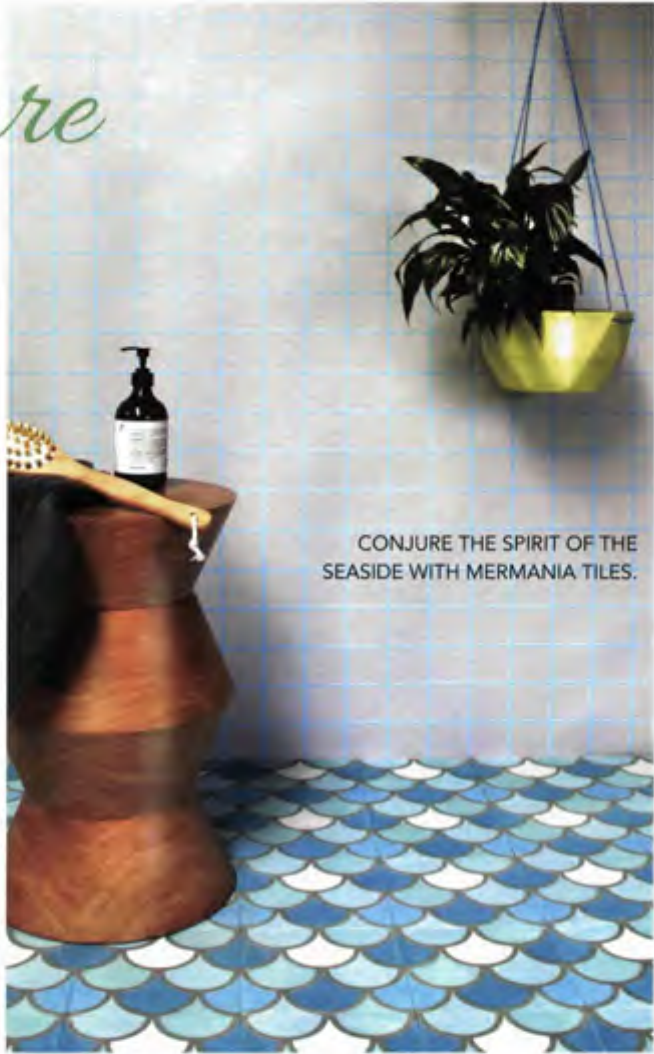
CONJURE THE SPIRIT OF THE SEASIDE WITH MERMANIA TILES.