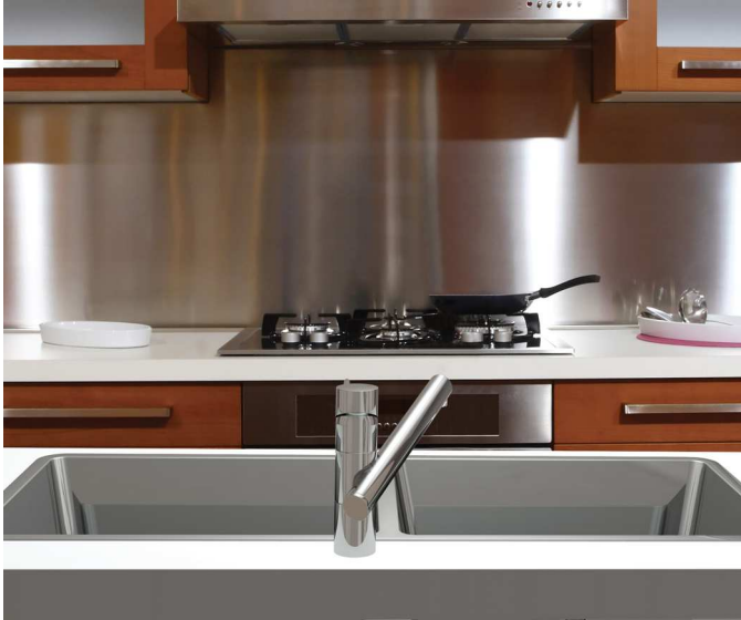
Featured With Tangent Sink Mixer