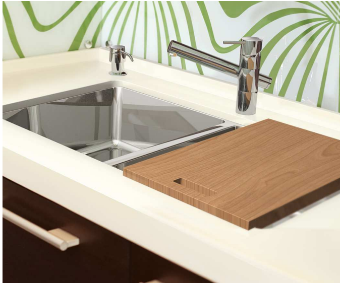
Featured With Tangent Sink Mixer + Timber Cutting Board + Stainless Steel Soap Pump