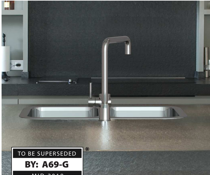
Featured With Tangent Gooseneck Sink Mixer