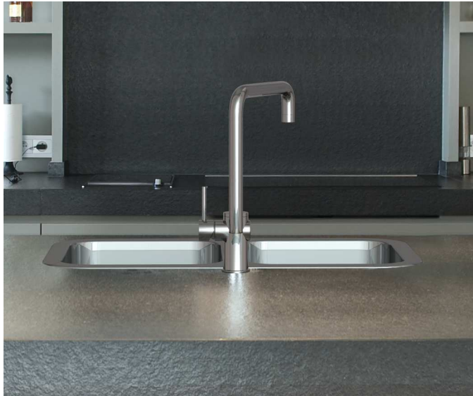
Featured With Tangent Gooseneck Sink Mixer