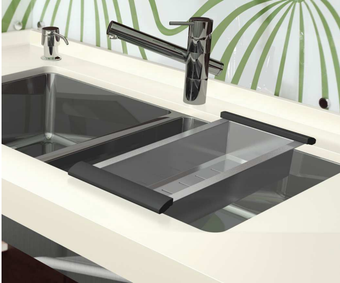
Featured With Tangent Sink Mixer + Stainless Steel Soap Pump