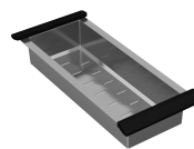
CL01 Stainless Steel Colandar