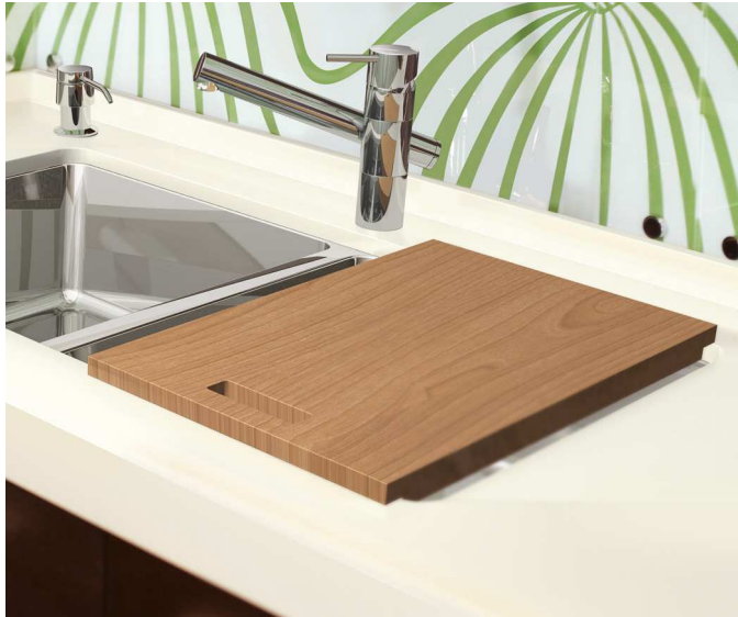
Featured With Tangent Sink Mixer + Stainless Steel Soap Pump