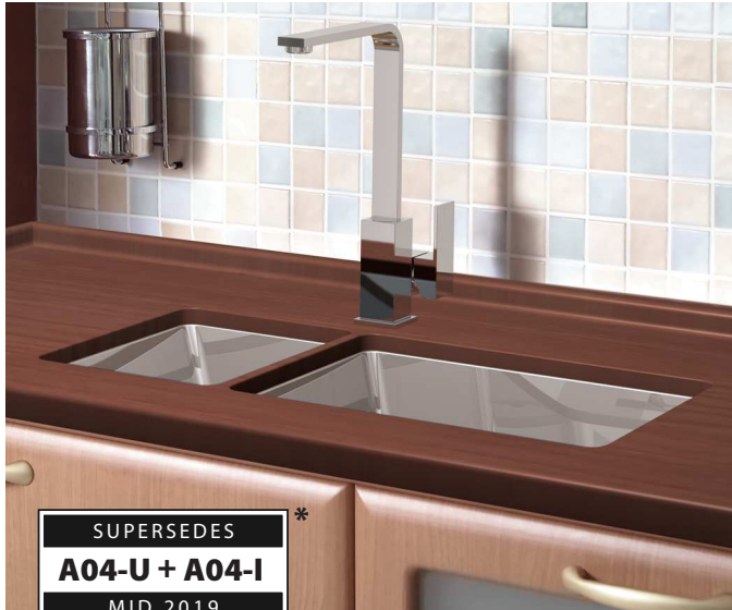
Featured With Scandro Sink Mixer