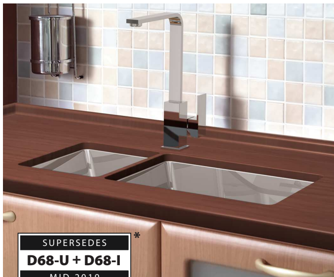
Featured With Scandro Sink Mixer