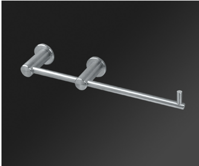
Pictured above with optional extra 30mm Backing Plates

Bathroom Accessories - Toilet Roll Holder Product Code: Hi1017LSS ( Brushed Nickel )