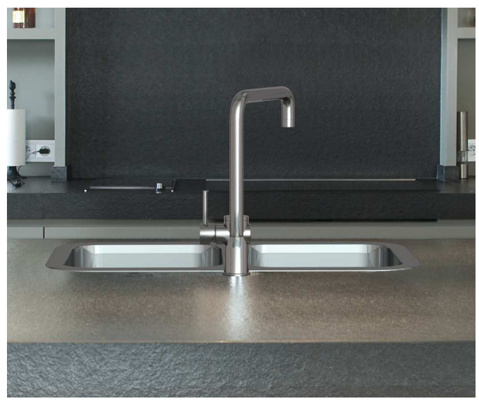
Featured With Tangent Gooseneck Sink Mixer