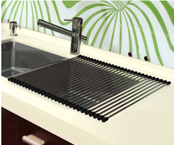
Featured With Tangent Sink Mixer + Stainless Steel Soap Pump