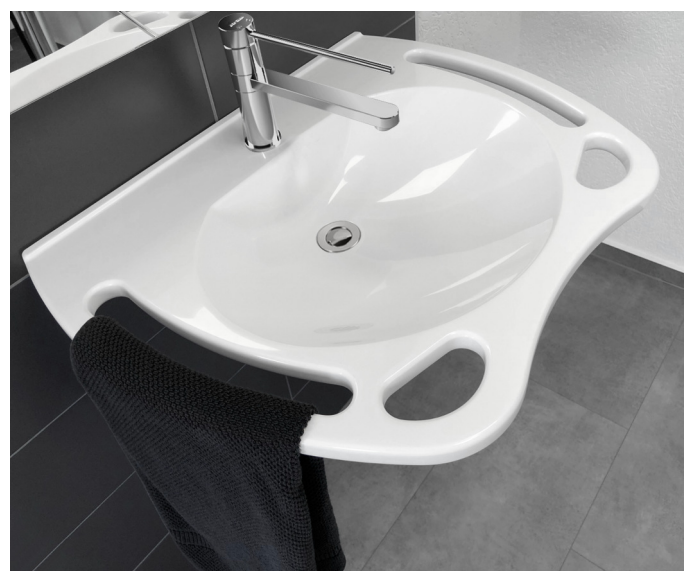
Featured with Benelli Freedom Care Mixer 38119 ( Sold Separately )

700mm Solid Surface Resin Washbasin - Gloss White Code: WBM-700-1