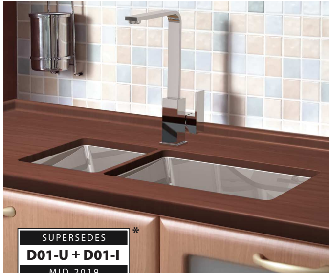
Featured With Scondro Sink Mixer