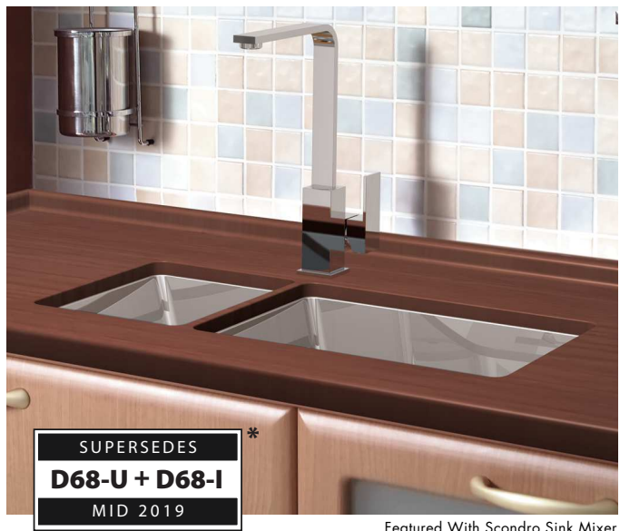
Featured With Scondro Sink Mixer