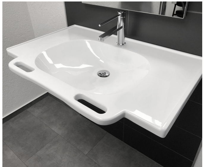
Featured with Benelli Freedom Care Mixer 38119 ( Sold Separately )

850mm Solid Surface Resin Washbasin - Gloss White Code: WBM-850-1