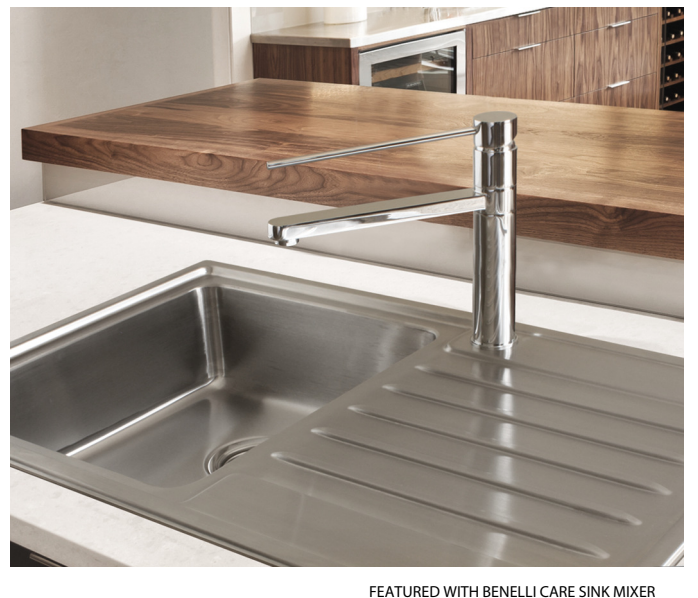
Dimensions 800mm (w) x 500mm (d) x 145mm (h)

Left Hand Bowl - Kitchen Sink with Drainer Stainless Steel Code LAB20-145LHB